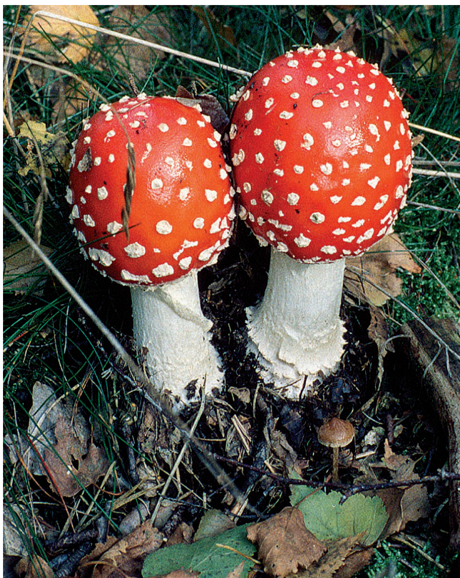
Mycorrhizal associates. Trees allocate carbon to ectomycorrhizal fungi such as Amanita muscaria .